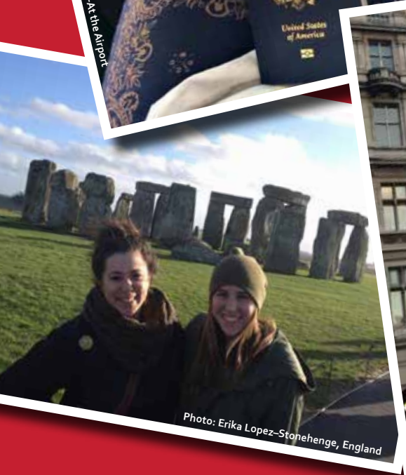
Stonehenge, England