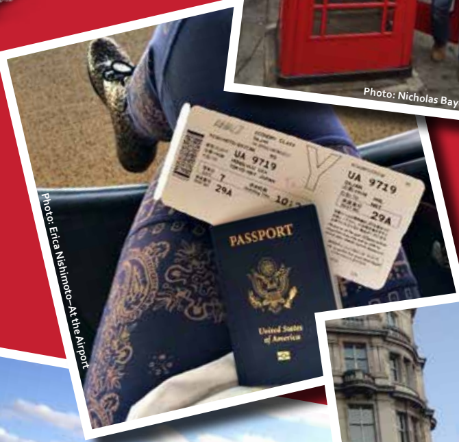
At the Airport