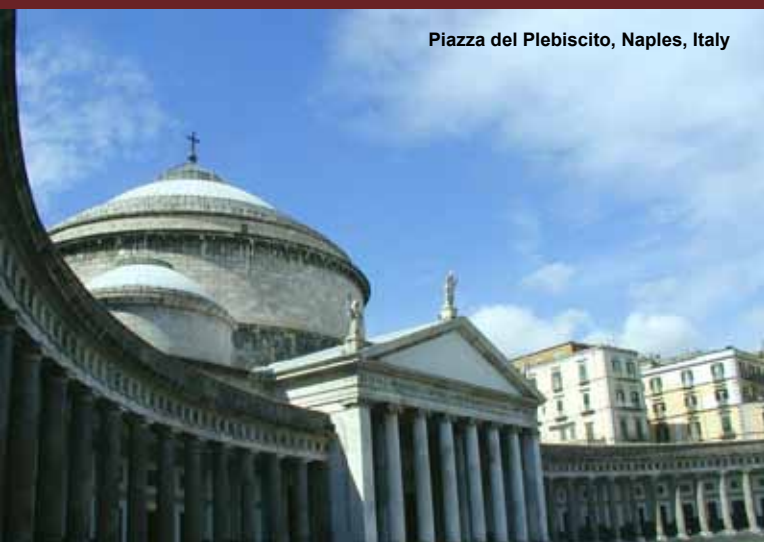
Piazza del Plebiscito, Naples, Italy

Breakfast is provided on the program. All other meals will be the responsibility of the student. Students are encouraged to explore the culinary offerings available in each city.