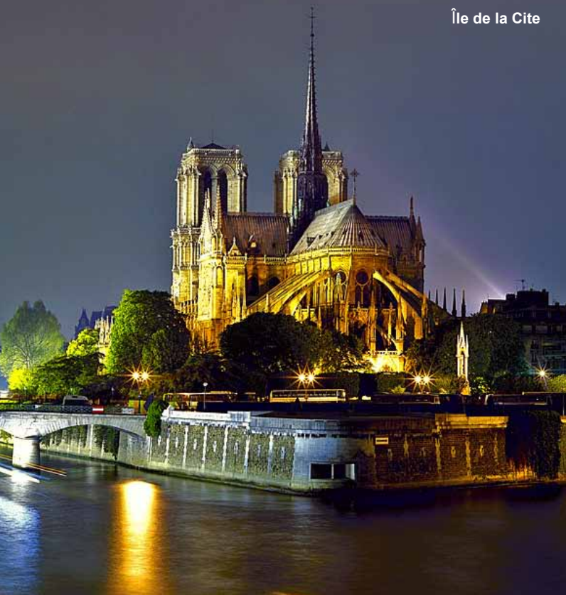
Île de la Cité