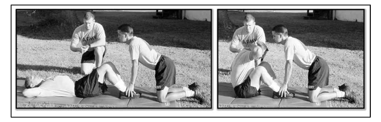
Figure A-4. Sit-up additional checkpoints

A-28. During the sit-up event, the scorer kneels or sits 3 feet from the Soldier's left or right hip. The scorer's head should be even with the Soldier's shoulder when he is in the vertical (up) position (refer to Figure A-4). Additional checkpoints to explain and demonstrate for the sit-up event are as follows: