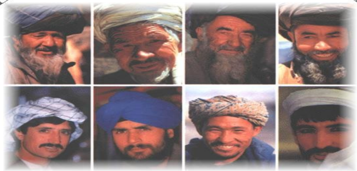
Pashtuns Uzbeks & Turkmen Tajiks Hazaras Nuristanis Aimaqs Balochis