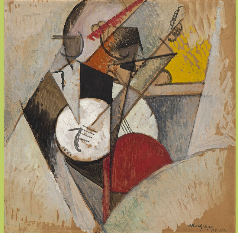
Albert Gleizes, 1915, Composition pour Jazz , Solomon R. Guggenheim Museum, New York