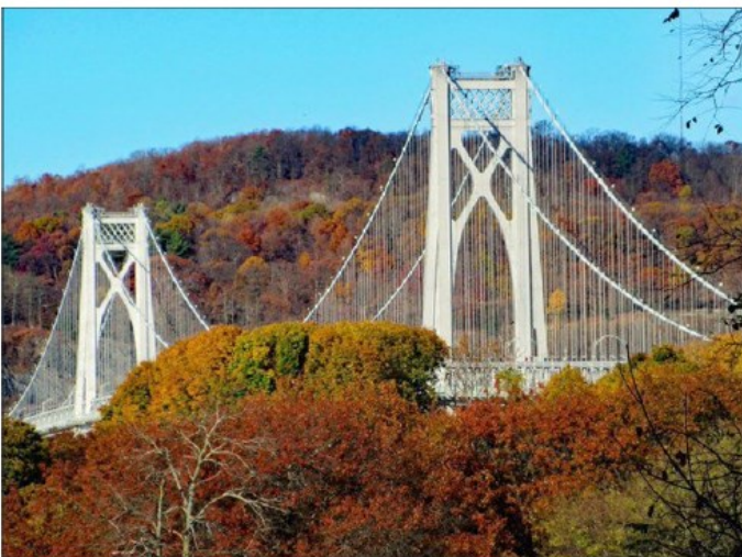
Mid-Hudson Bridge