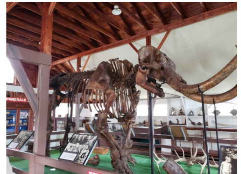
above photos taken at Museum Village of Old Smith's Clove, Monroe, NY