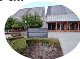
Wallace Center, FDR Library 2017-18