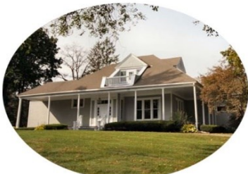
Poughkeepsie Tennis Club 1999 - 2000, 2001 - 2010