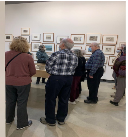
above photos taken at William Louis-Dreyfus Foundation, Mt. Kisco, NY