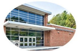
Poughkeepsie Library 2017-18