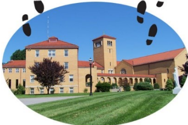
Mt. Alvernia 2000