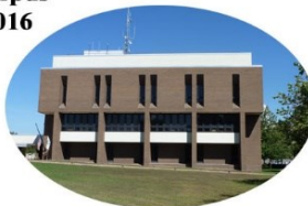
Town of Poughkeepsie TownHall 2018