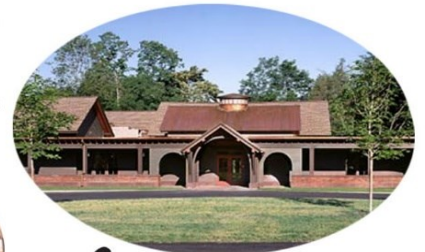
Locust Grove 2010 - Present