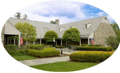
FDR Presidential Library 1992 - 1995