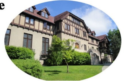
Vassar Alumni House 1996 - 1999