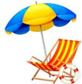
* Returning Member