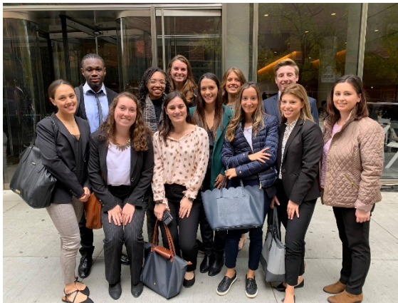
Memorial Sloan Kettering