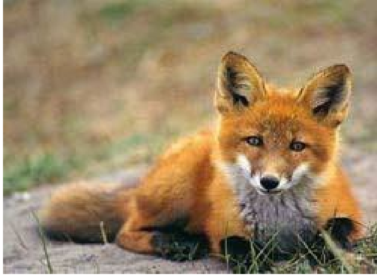
The official mascot of Marist University is the red fox.