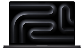
16-inch MacBook Pro® $2499

Apple M5 chip with 10-core CPU 10-core GPU 16GB unified memory 1TB SSD storage