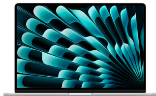
15-inch MacBook Air® $1199

A18 Pro with 6-core CPU 5-core GPU 8GB unified memory 256GB SSD storage