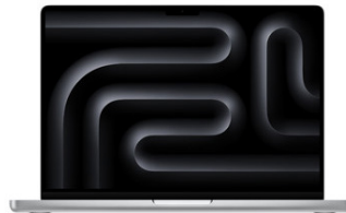
14-inch MacBook Pro® $1599

Apple M5 chip with 10-core CPU 10-core GPU 16GB unified memory 512GB SSD storage