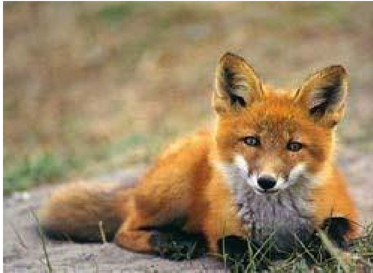
The official mascot of Marist University is the red fox.