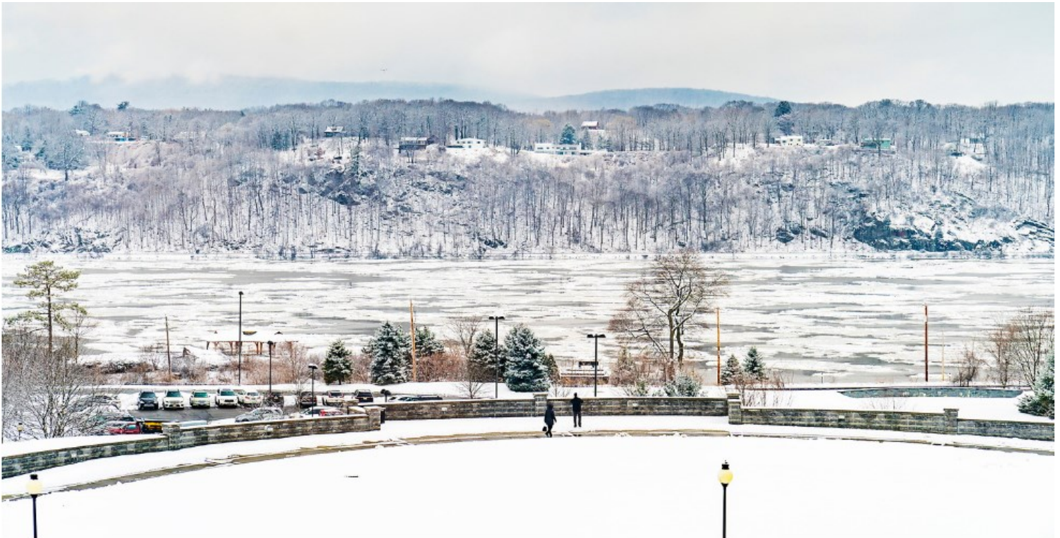
Winter at Marist College